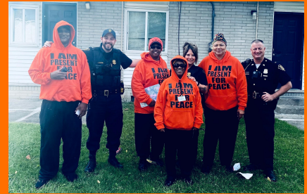
Table-Talk With Flint Peacekeepers

Shortly after reporting to complete the "One Hour of Power" on Saturday, October 7, Peacekeepers were met by a screaming mother asking for help to find her missing child. After devising a plan and then assembling to begin the search for the child the Flint Police Department arrived and joined the search. While searching for the child another set of Flint officers arrived stating they had received a call about a black female child missing. Both children were found during the Peacekeepers "One Hour Of Power". Officers from Flint Michigan police department transported the children back home.